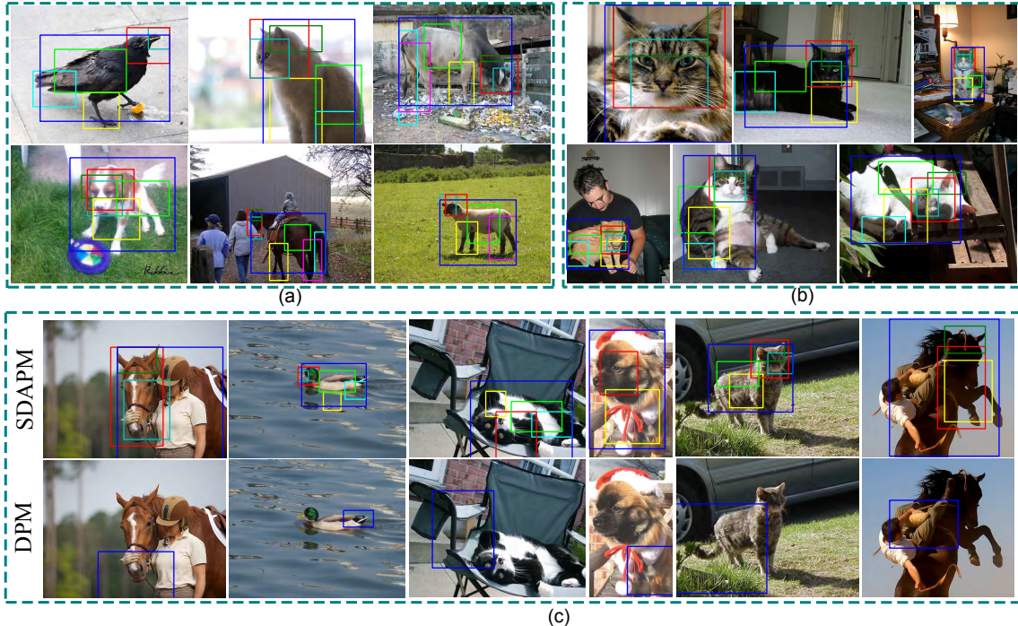
Figure 2. Our method provides a richer object representation and improves the detection results. The blue bounding boxes correspond to the whole object detection, and boxes of other colors correspond to semantic parts respectively, which may indicate different parts across classes. (a) shows one representative result for each of the six animal classes. (b) shows detection results of the cat class to illustrate the ability of our model to robustly represent objects under non-rigid deformations, viewpoint changes, and occlusions. (c) shows typical examples that are correctly localized by our Scene-Domain Active Part Model (SDAPM) but missed by DPM.