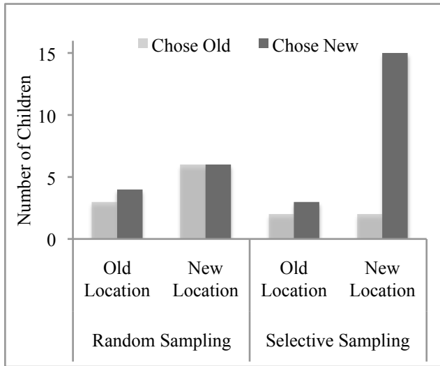
Figure 2: Number of non-trackers who chose the Old and New locations in each condition in response to the test question about the Frog’s belief.

instead responding as predicted: inferring that the Frog would rationally update his beliefs from the data.